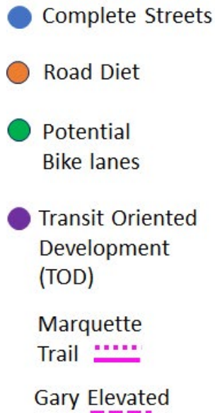
FIGURE 6-1. LAND USE PLAN